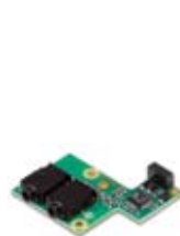
Option A2 (811350)