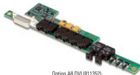
Option A8 DVI (811352)